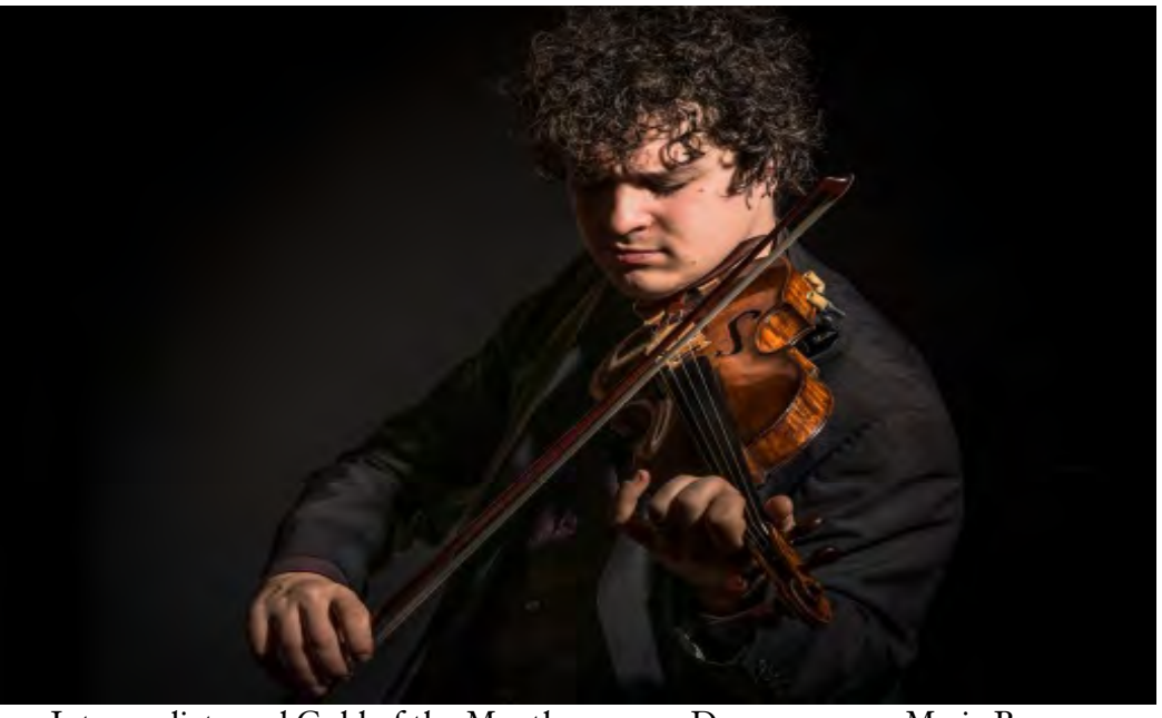
Intermediate and Gold of the Month