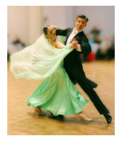
While I personally love an image that shows the whole of the subject, Philip made a compelling case for showing just part of the subject as dramatized in this image.